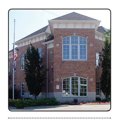
MAP TO GVH > 10 S SEYMOUR AVENUE

The Village Hall is located at 10 South Seymour Avenue in downtown Grayslake, just west of the railroad tracks, and just a couple of blocks away from our typical venue, the Heritage Center.