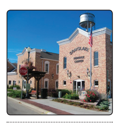
MAP TO GHC > 164 HAWLEY STREET

The <u>Grayslake Heritage Center & Museum</u> has become well known for assembling and displaying a wide variety of fascinating exhibits centered on Grayslake history. And we are part of that rich history! The Lake County Folk Club was founded in October 1991 at the Last Chance Saloon in downtown Grayslake.