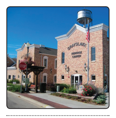
MAP TO GHC > 164 HAWLEY STREET

The Grayslake Heritage Center & Museum has become well known for assembling and displaying a wide variety of fascinating exhibits centered on Grayslake history. And we are part of that rich history! The Lake County Folk Club was founded in October 1991 at the Last Chance Saloon in downtown Grayslake.